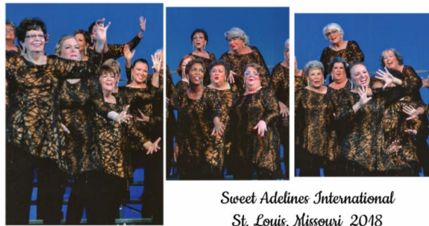
Sweet Adelines International St. Louis, Missouri 2018 Vocal Matrix Chorus